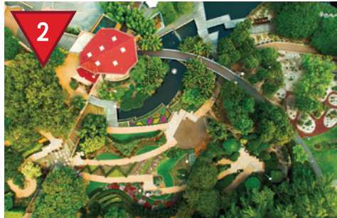
ROMA ST. PARKLANDS